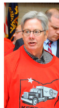
Commissioner Mayor Wade Kapszukiewicz