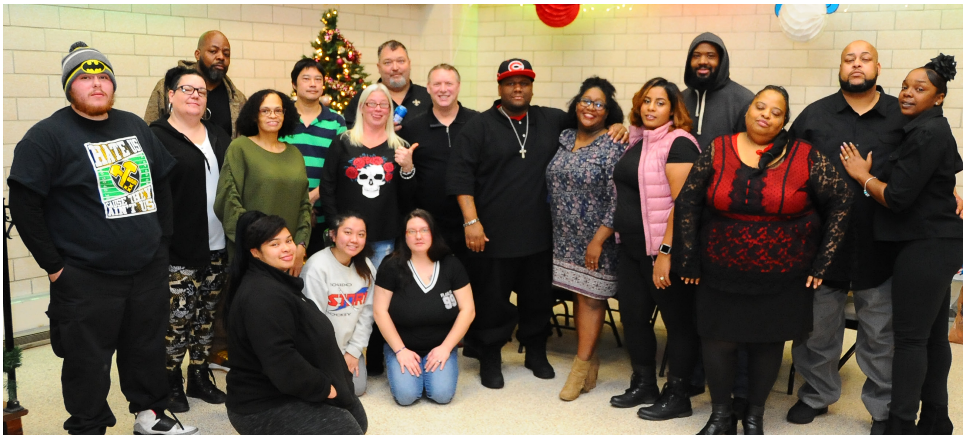
Members of Caravan Knights Unit of Local 12 stopped at Parlor B for their Christmas Party. Members and guests enjoyed an evening of food and music.