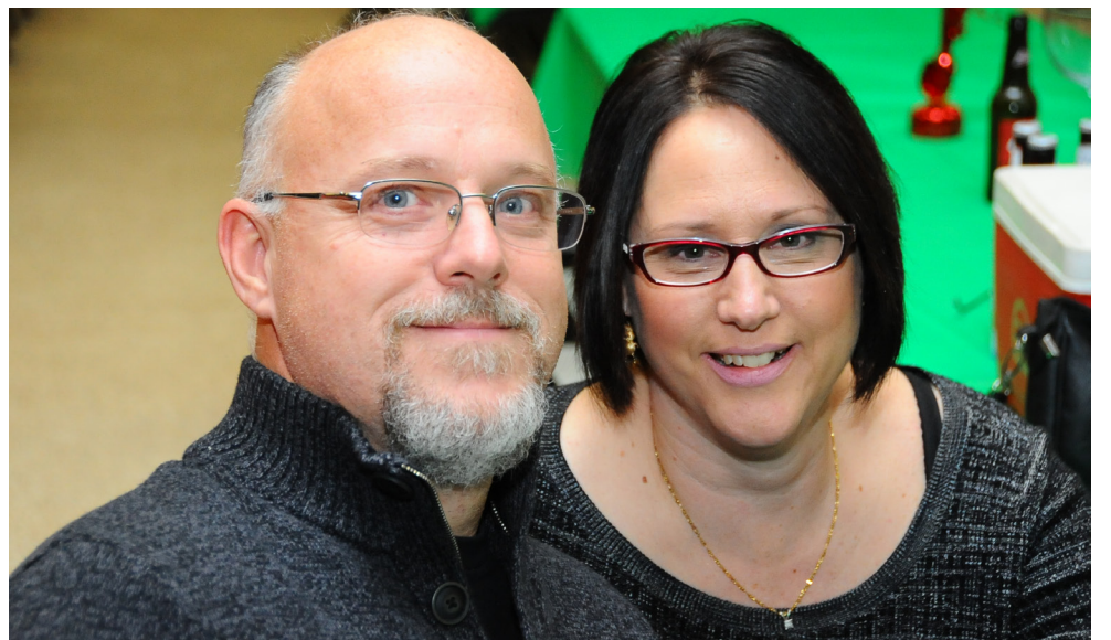
Members of the Toledo Molding & Die Unit of Local 12 stopped at the Local for their annual Christmas bash. Members enjoyed a great time together. Above are a few scenes from the event.