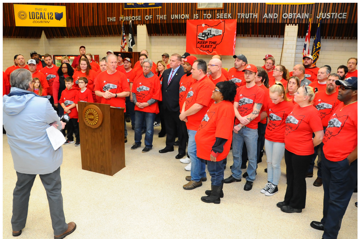
Jeep Fleet members, their families, and supporters meet at Local 12 Hall for a press conference protest the summary closing of Jeep's trucking fleet.